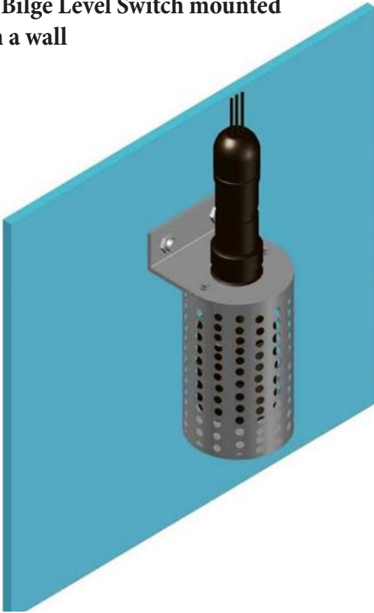
1. Bilge Level Switch mounted on a wall