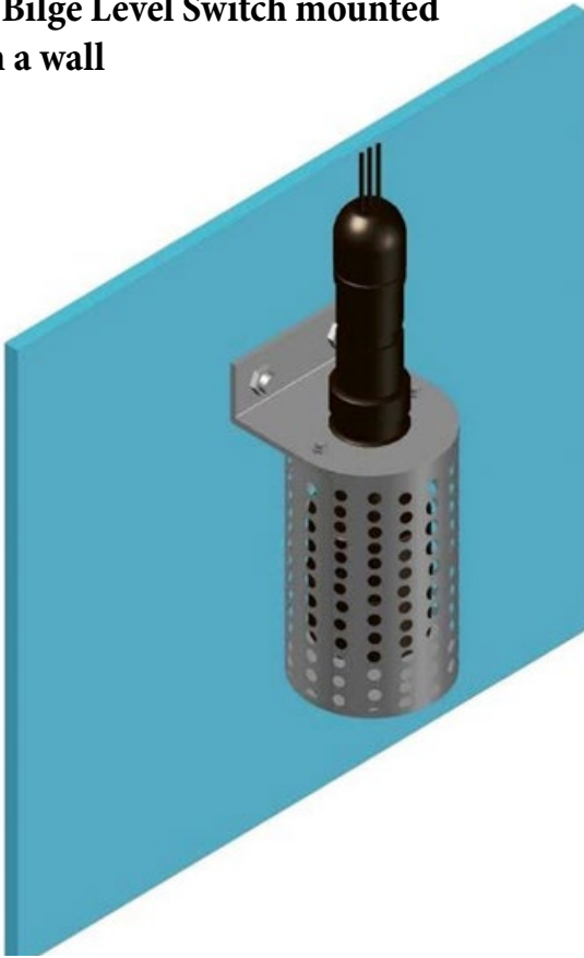
1. Bilge Level Switch mounted on a wall